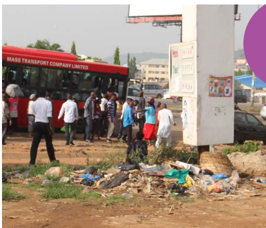
Around Abuja, buses often pick up from areas without shelter or protection.

In each of the cities examined, the number of buses was inadequate for the number of women using them. Consequent overcrowding means women and girls struggle to board and disembark which leads to more incidences of sexual harassment against them. The favela of Heliópolis in São Paulo is severely under-served by buses, which leads to women and girls having to wait at bus stops for long periods of time. Given their time pressures to combine commuting to work with unpaid care responsibilities, when journey times get longer and more unpredictable, women are forced into choosing income-earning activities that are closer to home regardless of other factors such as skills, safety, pay level, availability of markets, etc.