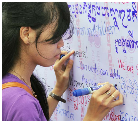
An activist shares her message of solidarity at the launch of the Safe Cities for Women campaign in Cambodia, 2014.

At the UN Habitat III Conference in October 2016, governments established a new urban agenda highlighting new challenges that will be tackled over the next 20 years. Right to the city was included for the first time in a UN declaration (an important paradigm that strengthens the fight for gender responsive public services). Urban mobility and public transportation is one of the key issues on this new urban agenda. 3