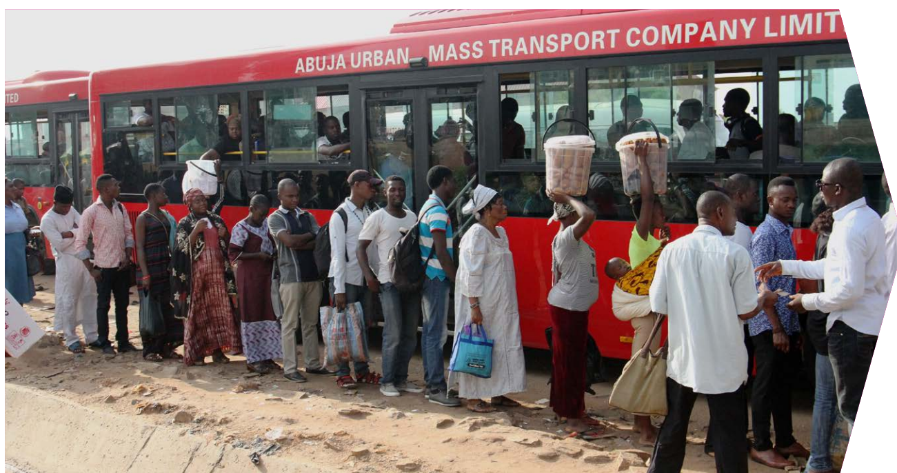
In Abuja, Nigeria, public transport from the outskirts can be expensive, busy and without shelter or lighting, dangerous.

This report looks at the quality of public transport provision for women and girls across three major cities: Dhaka (Bangladesh), Abuja (Nigeria) and São Paulo (Brazil). Bus services were examined as they were the most readily comparable component of public transport. This report analyses the issue of women's security on public transportation and offers solutions for bus systems which facilitate women's freedom to move. Currently, the Governments of Bangladesh, Nigeria and Brazil are failing to provide safe, secure and reliable services for women and girls. Safe public transportation systems are a necessary prerequisite for women and girls to be able to exercise their right to freedom of movement and their right to enjoy and use their cities' services without the threat of sexual violence or harassment.