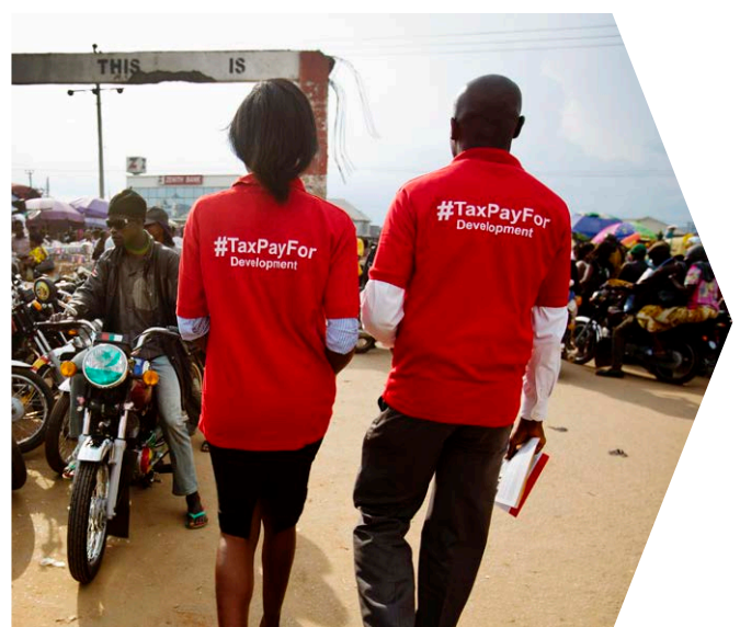
Activists reach out to sellers and the public at a market in Abuja, 2013, as part of the Tax Justice campaign.

When examining the tax-foregone figures it is clear, when even looking at a very limited number of features, that closing tax loopholes can lead to substantial increases in revenue for governments. Corporate tax dodging clearly undermines the efforts of governments to secure resources to cover the costs of gender responsive public services. Governments must ensure that the additional revenue from closing tax loopholes prioritises women's unique needs and goes towards the provision of quality public services that uphold and protect women's rights.