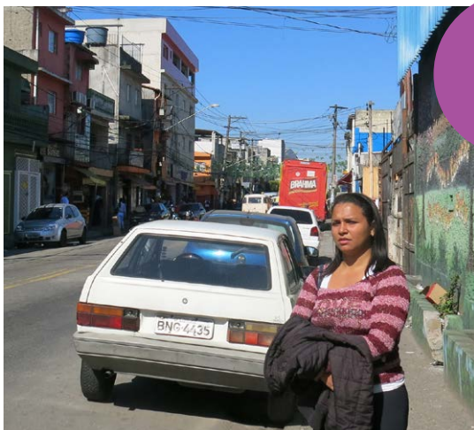
In São Paulo, women reported that they often fear using public transport.

In Dhaka, 80% of low-income female factory workers (formal and informal) cannot afford public transport and have to walk to work, against 61% of low-income male production workers. 6 In São Paulo, it costs approximately US$3 for a return journey to the city centre, and yet the minimum wage in Brazil is around US$200 per month. For those travelling daily to the city centre, public transport costs could amount to almost half their monthly wage.