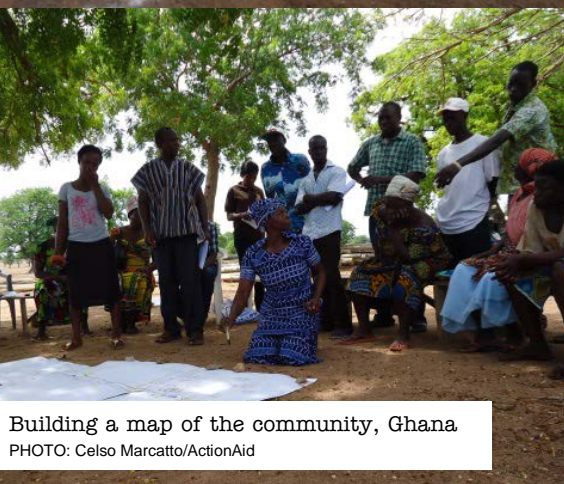
Building a map of the community, Ghana