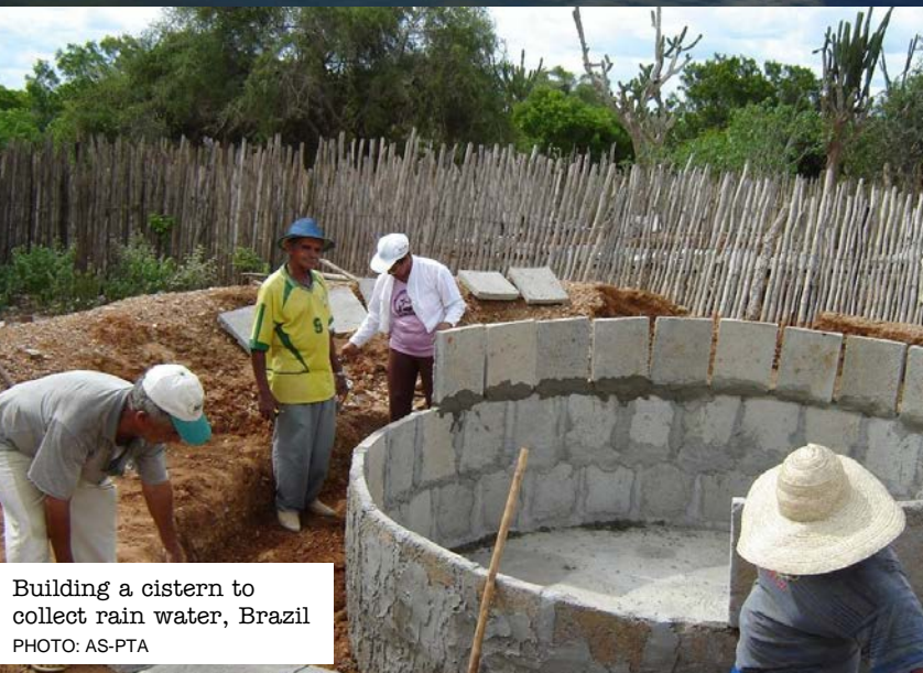
Building a cistern to collect rain water, Brazil