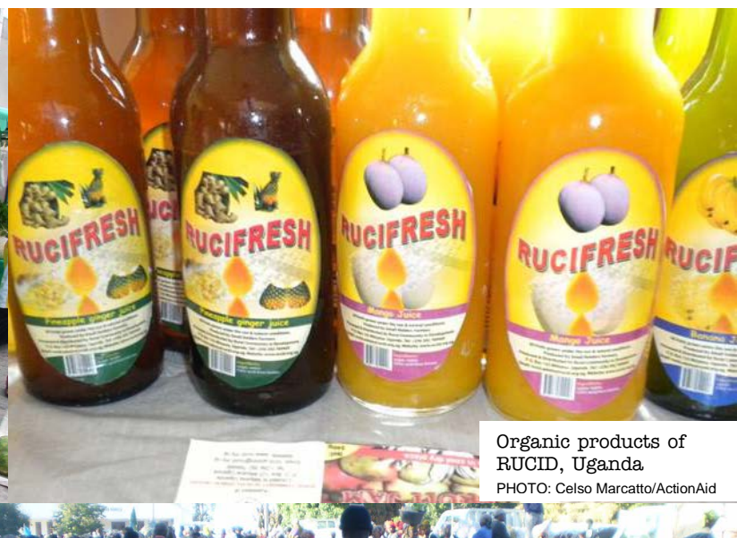
Organic products of RUCID, Uganda