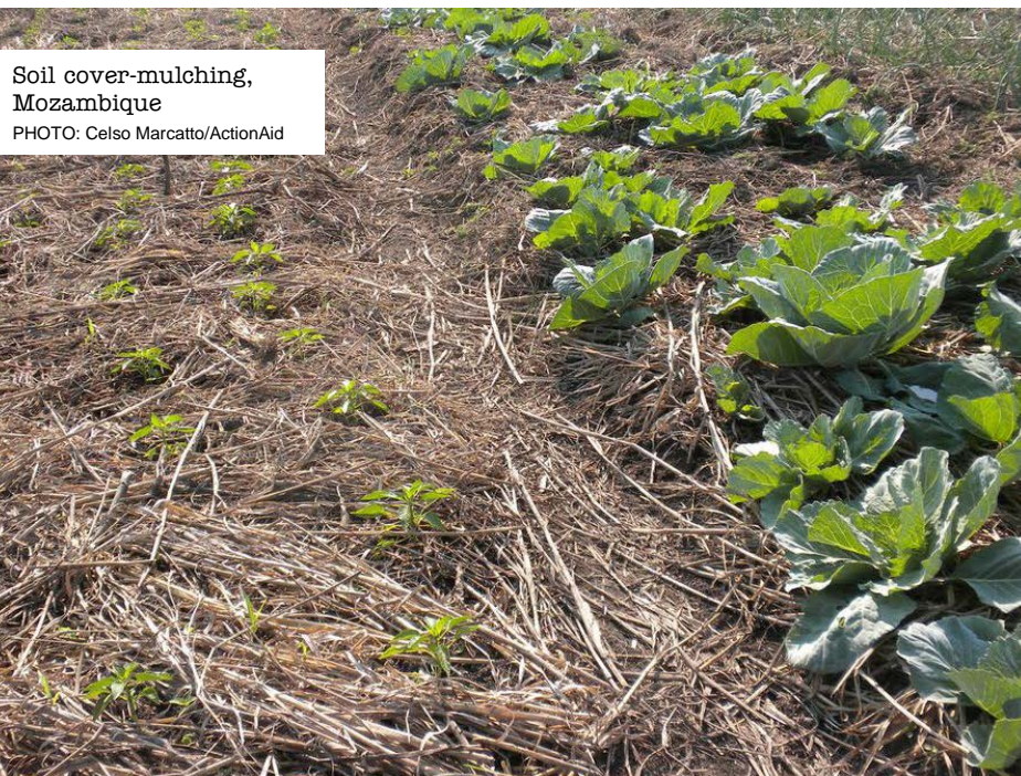
Soil cover-mulching, Mozambique