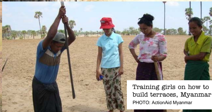
Training girls on how to build terraces, Myanmar