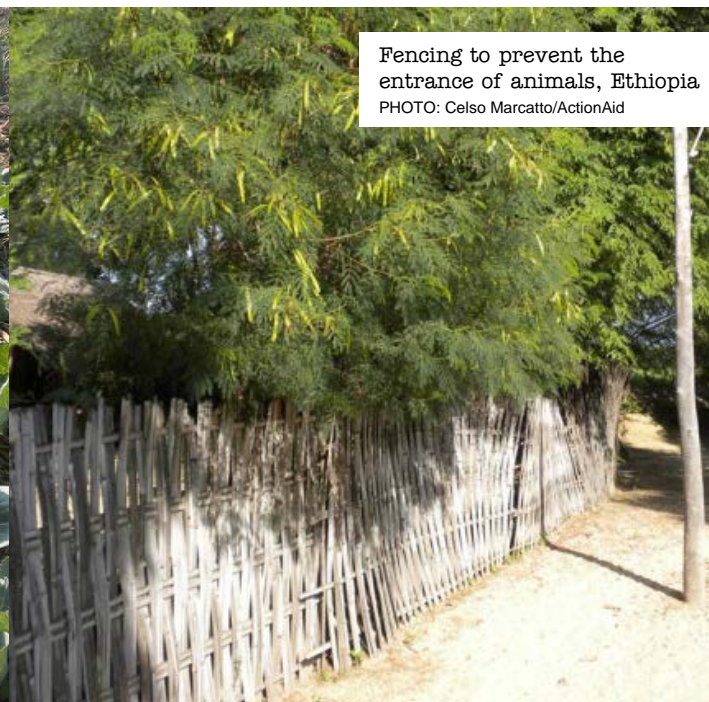
Fencing to prevent the entrance of animals, Ethiopia