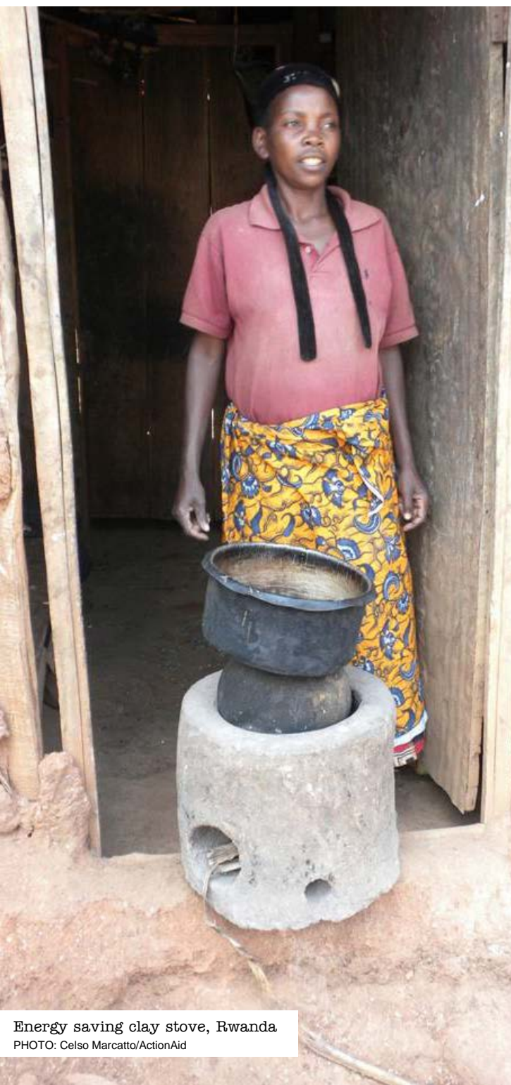
Energy saving clay stove, Rwanda

It is important to note here that in many places, women's groups are still in their first stages and that women may find it difficult to organise themselves to talk about their experiences due to social constraints. Moreover, women are often invisible to policymakers and not considered farmers in their own right. ActionAid's experience on the ground shows that farmer-to-farmer exchange programmes designed specifically for women can be very effective in empowering women and encouraging their participation on the identification and documentation of local knowledge.