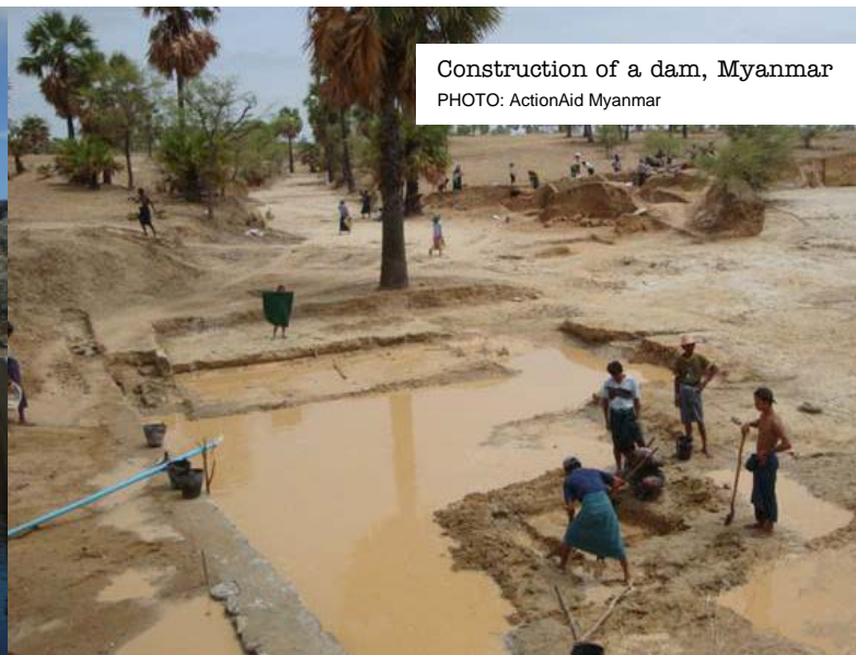
Construction of a dam, Myanmar