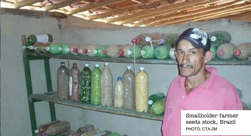
Smallholder farmer seeds stock, Brazil