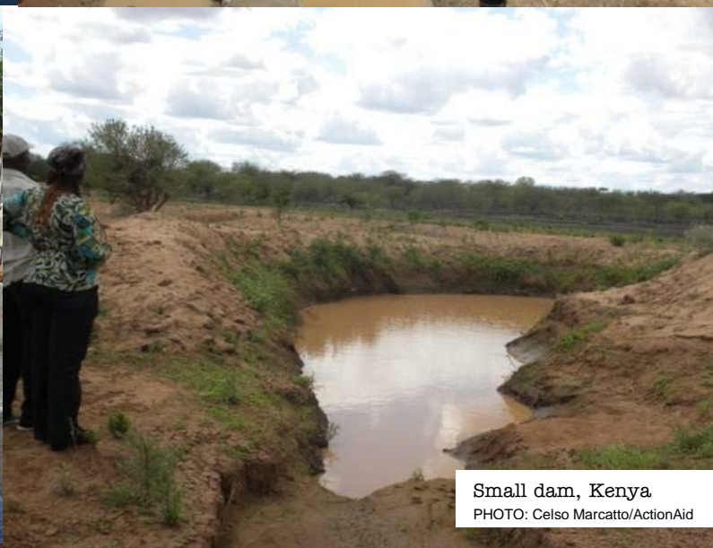
Small dam, Kenya