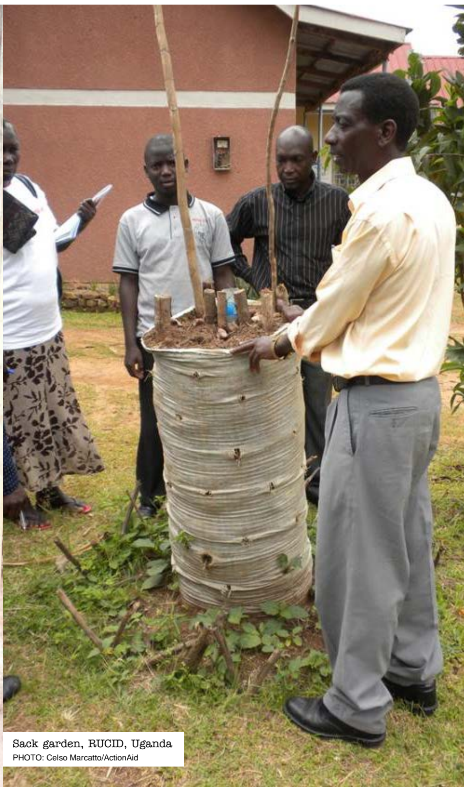
Sack garden, RUCID, Uganda