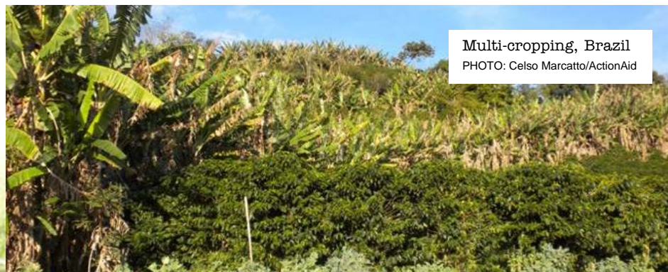
Multi-cropping, Brazil