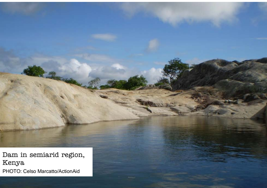
Dam in semiarid region, Kenya