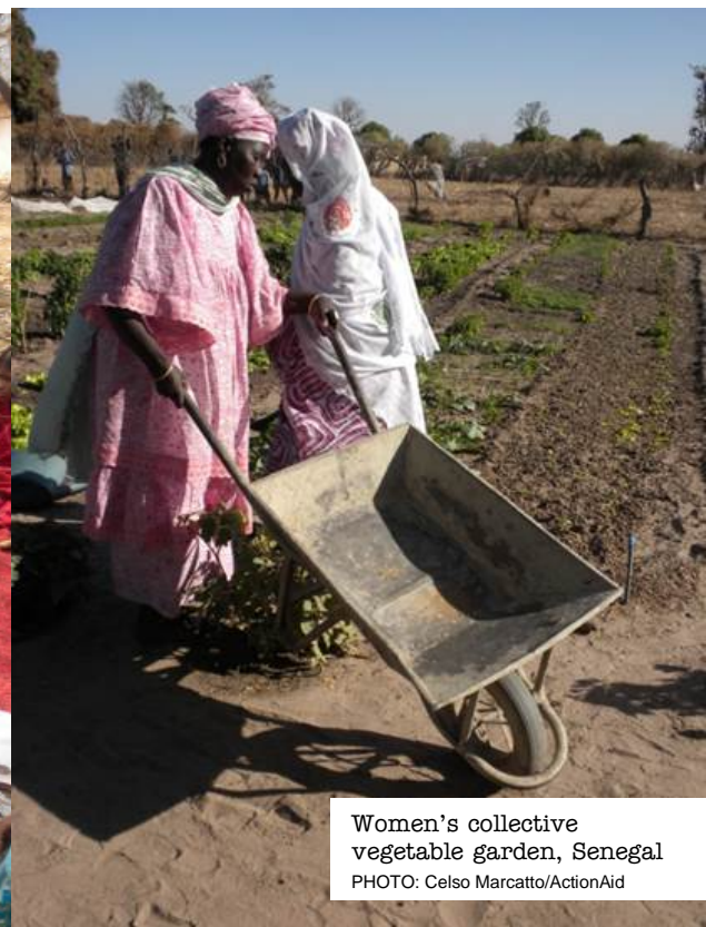
Women's collective vegetable garden, Senegal