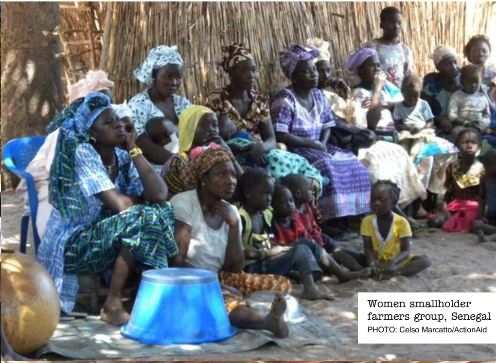
Women smallholder farmers group, Senegal