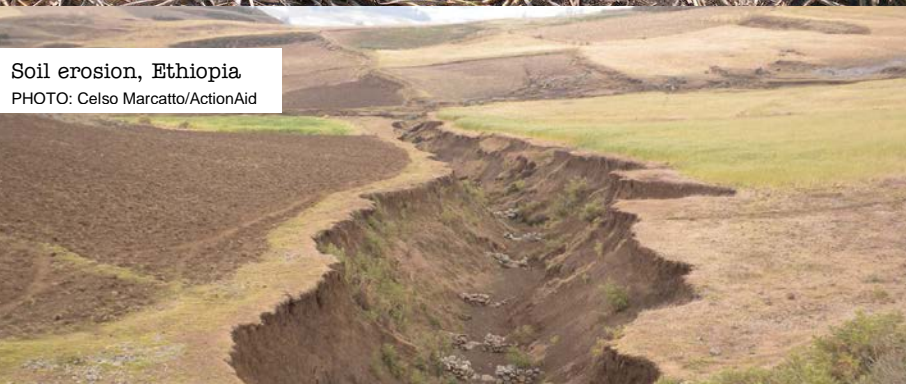
Soil erosion, Ethiopia