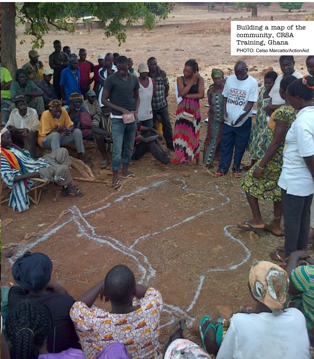
Building a map of the community, CRSA Training, Ghana