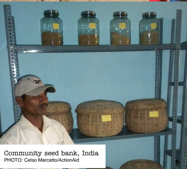
Community seed bank, India