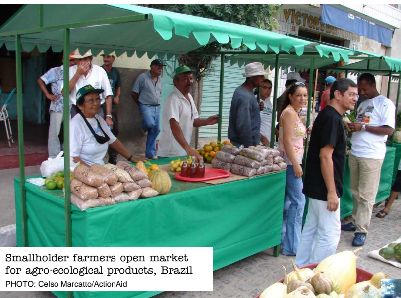
Smallholder farmers open market for agro-ecological products, Brazil