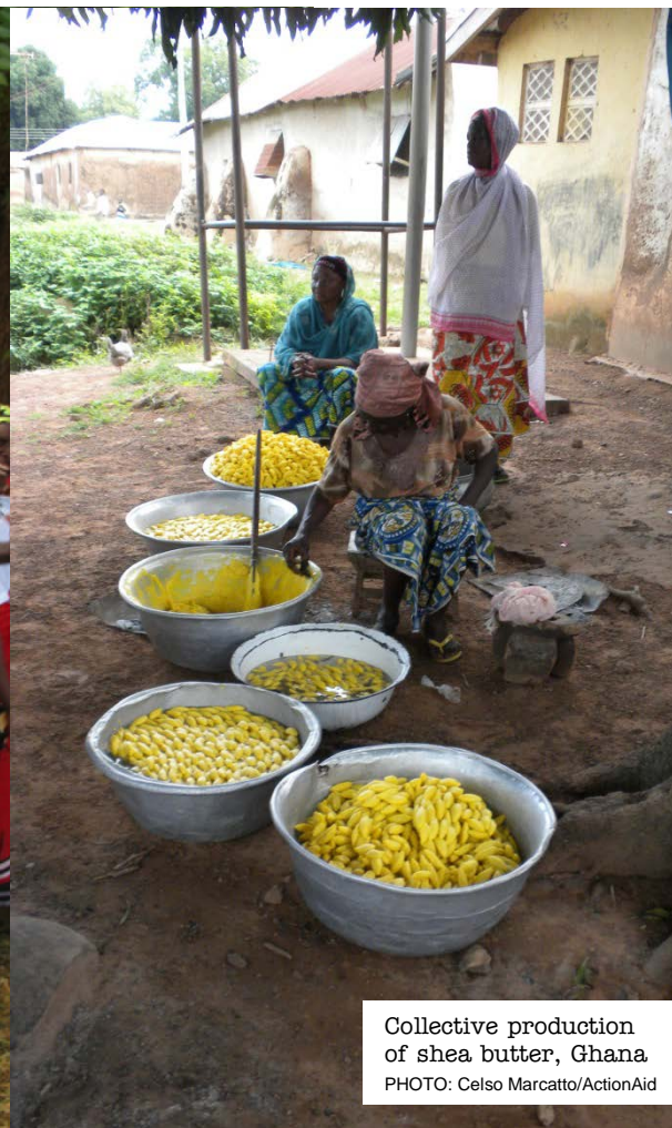
Collective production of shea butter, Ghana