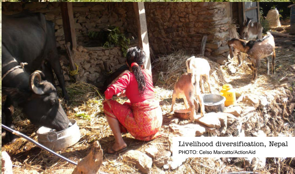
Livelihood diversification, Nepal