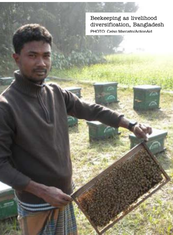
Beekeeping as livelihood diversification, Bangladesh