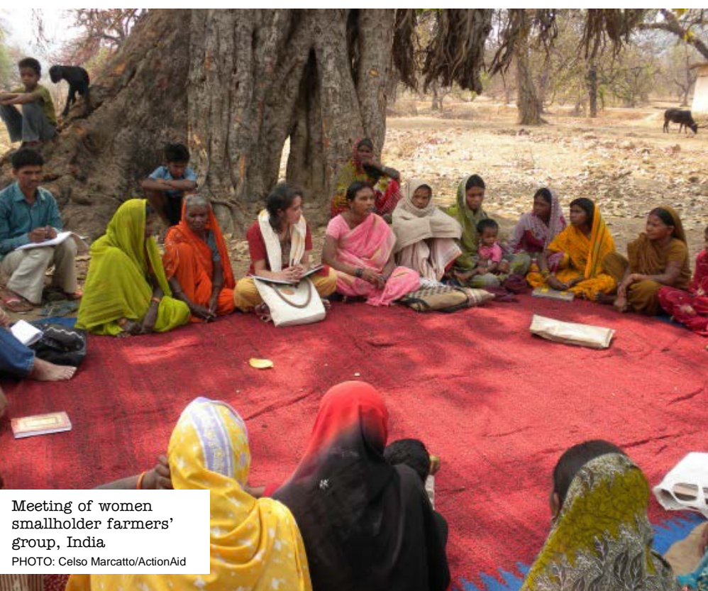
Meeting of women smallholder farmers' group, India