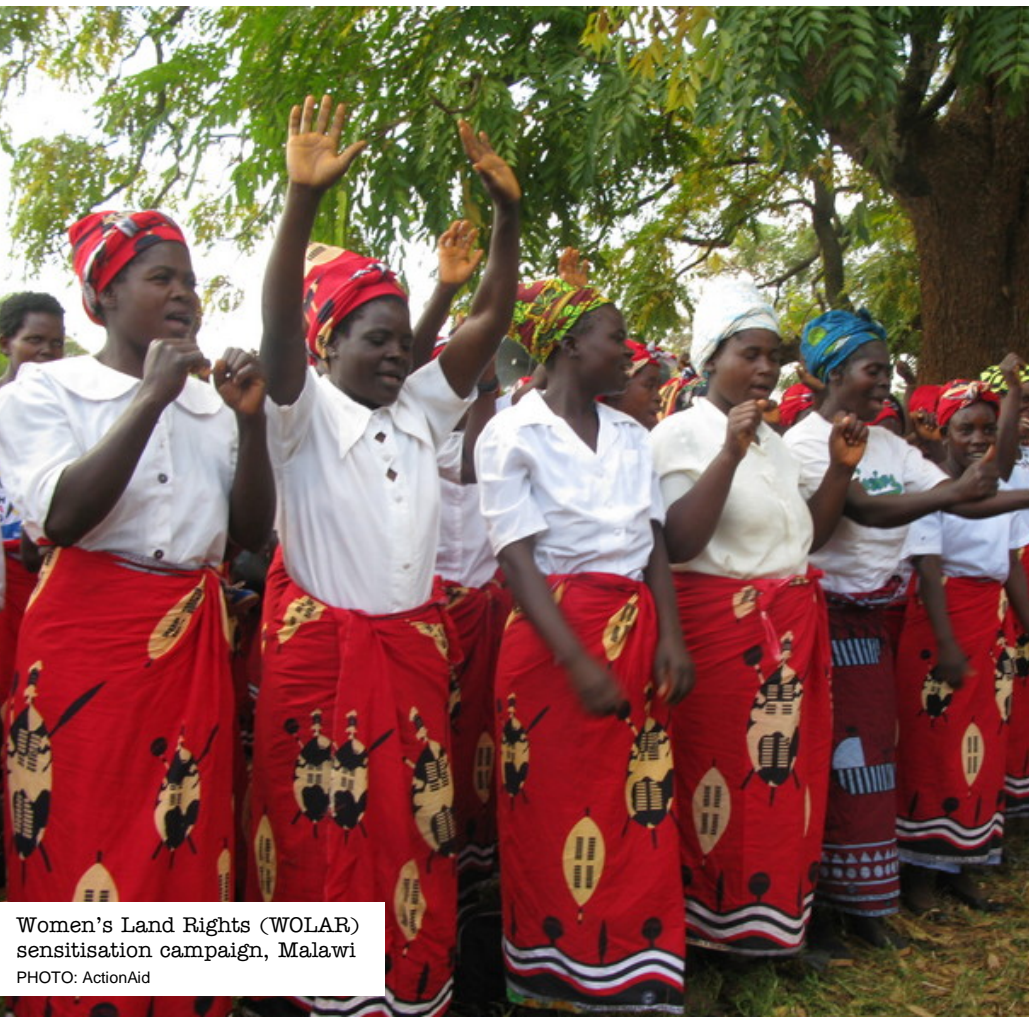
Women's Land Rights (WOLAR) sensitisation campaign, Malawi