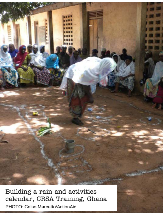
Building a rain and activities calendar, CRSA Training, Ghana