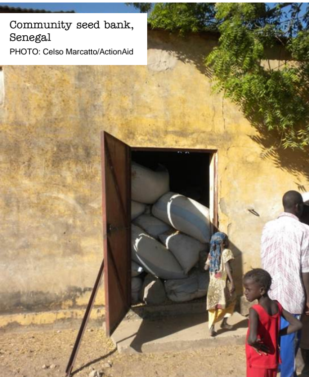
Community seed bank, Senegal