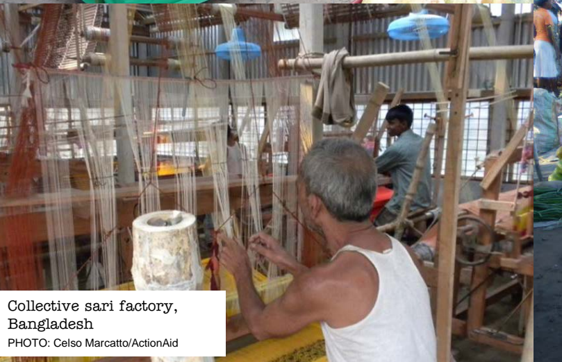
Collective sari factory, Bangladesh