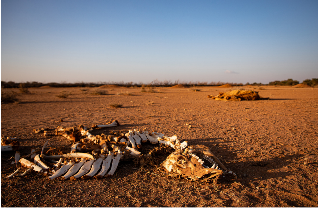
Livestock animals are often first to succumb to drought as farmers focus limited water supplies on their families' survival. The remains of livestock found outside the pastoral community of Ceel-Dheere, Somaliland.