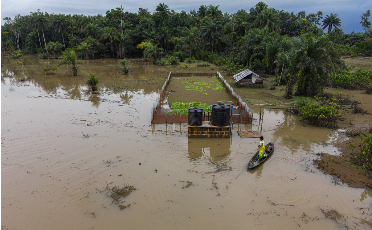
Flooding of the Niger Delta, Nigeria, is one of the direct impacts of climate change on local communities. Around a historic climate case against Shell in the Netherlands, activists spoke out on how the fossil fuel giant has devastated their communities with oil spills, gas flaring, polluted water and human rights abuses.