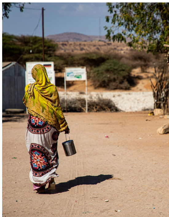
Due to a climate-change-fuelled drought, the last remaining lifeline for the community of Ceel-Dheere, Somaliland, is a shallow well.

ActionAid’s emergency teams must now work with local women-led and youth-led partner organisations to provide life-saving food relief and water in the region. More humanitarian support is urgently needed. If you would like to find out more or donate, please click here .