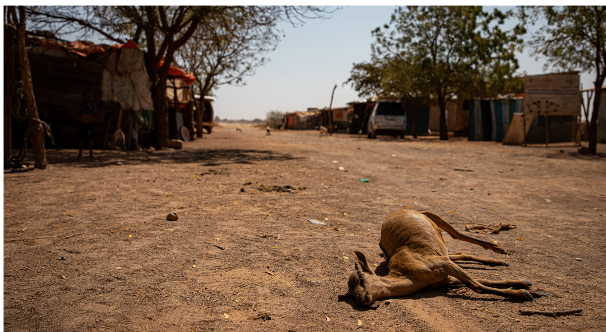
Millions of livestock have died in the Horn of Africa due to drought.

Gellgelo Wele Shake, 54, had 200 cows and around 100 goats and sheep. As a result of the drought, he now has only five goats and two cows. Gellgelo has 10 children but he is unable to support them, and they have now gone to live with other family members. The drought has displaced him from his village in Rhamet Cluster and now he is a refugee in Kelkeloo village of Watchile Woreda. Gellgeo now makes and sells charcoal, however the remote location and lack of market means that his income is very small. He lives on loans and only eats bread once a day.