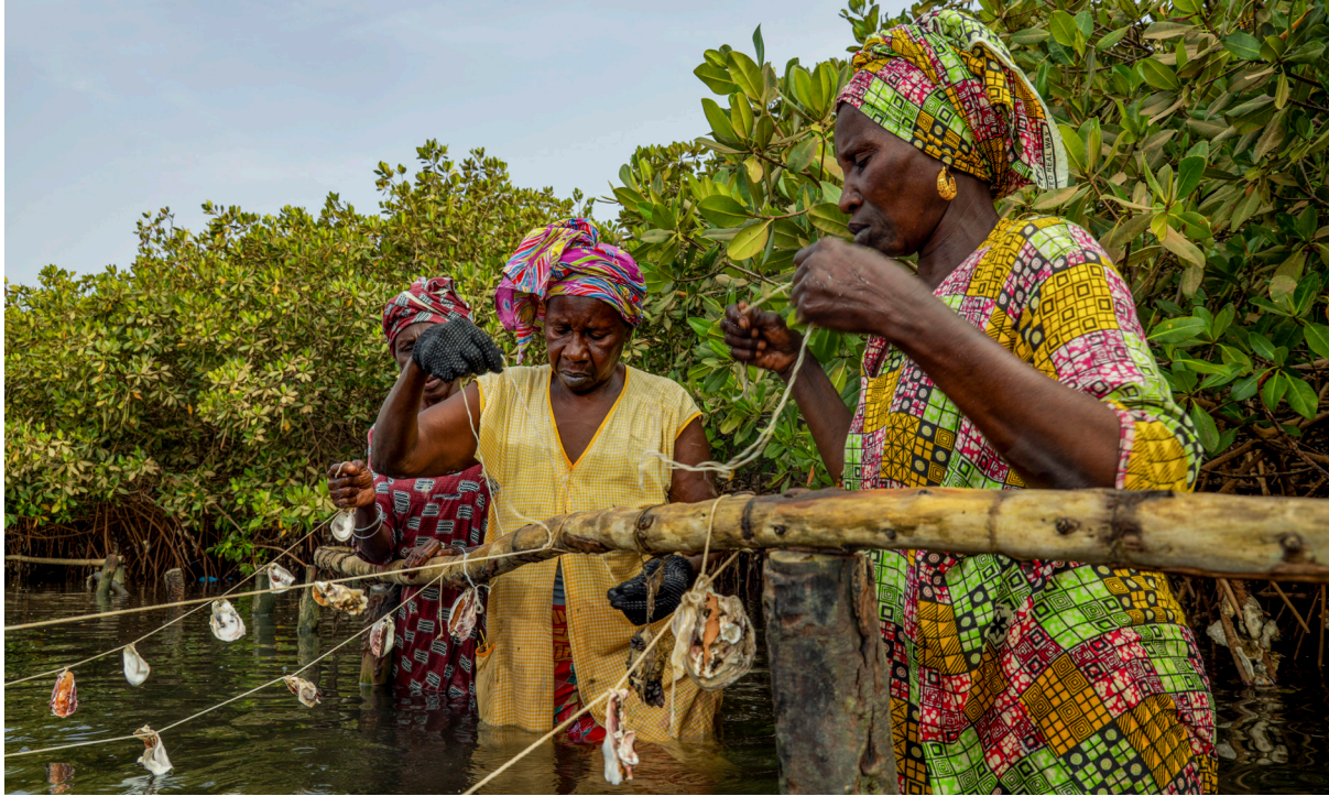
The Saloum Delta islands, Senegal, including the island of Djirnda, are on the frontline of climate change. Here, a local women's group who farm oysters are leading a climate adaption project, focused on growing mangroves to fight the impacts of coastal erosion and climate change.