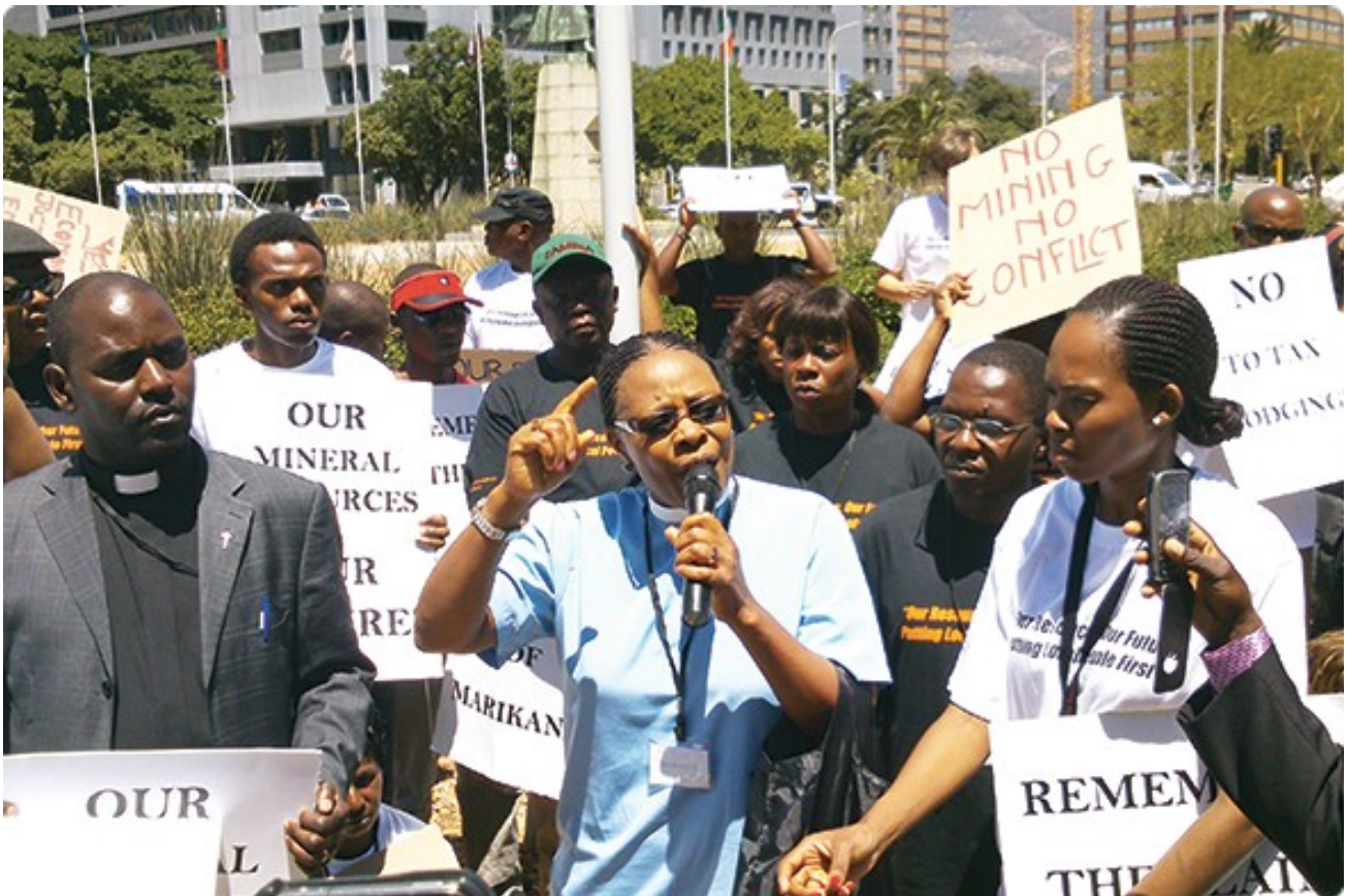
Zambian clergy demand mining companies pay adequate taxes to the government (ActionAid).

social media smear campaigns: some opposition politicians are engaging in these tactics too. [9] In this increasingly polarised and toxic landscape, there is a risk that Zambia's hard-won democratic traditions will give way to "winner takes all" politics fought between elites, destroying the space for informed debate on policies that will benefit all.