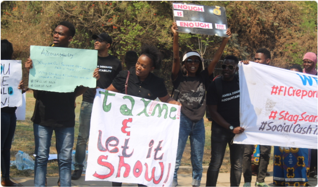
Youth demand accountability for the use of public funds as the 2019 government budget is presented (ActionAid). Cover photo - Police officers surround a protestor from an opposition party during the last elections (Salim Dawood).