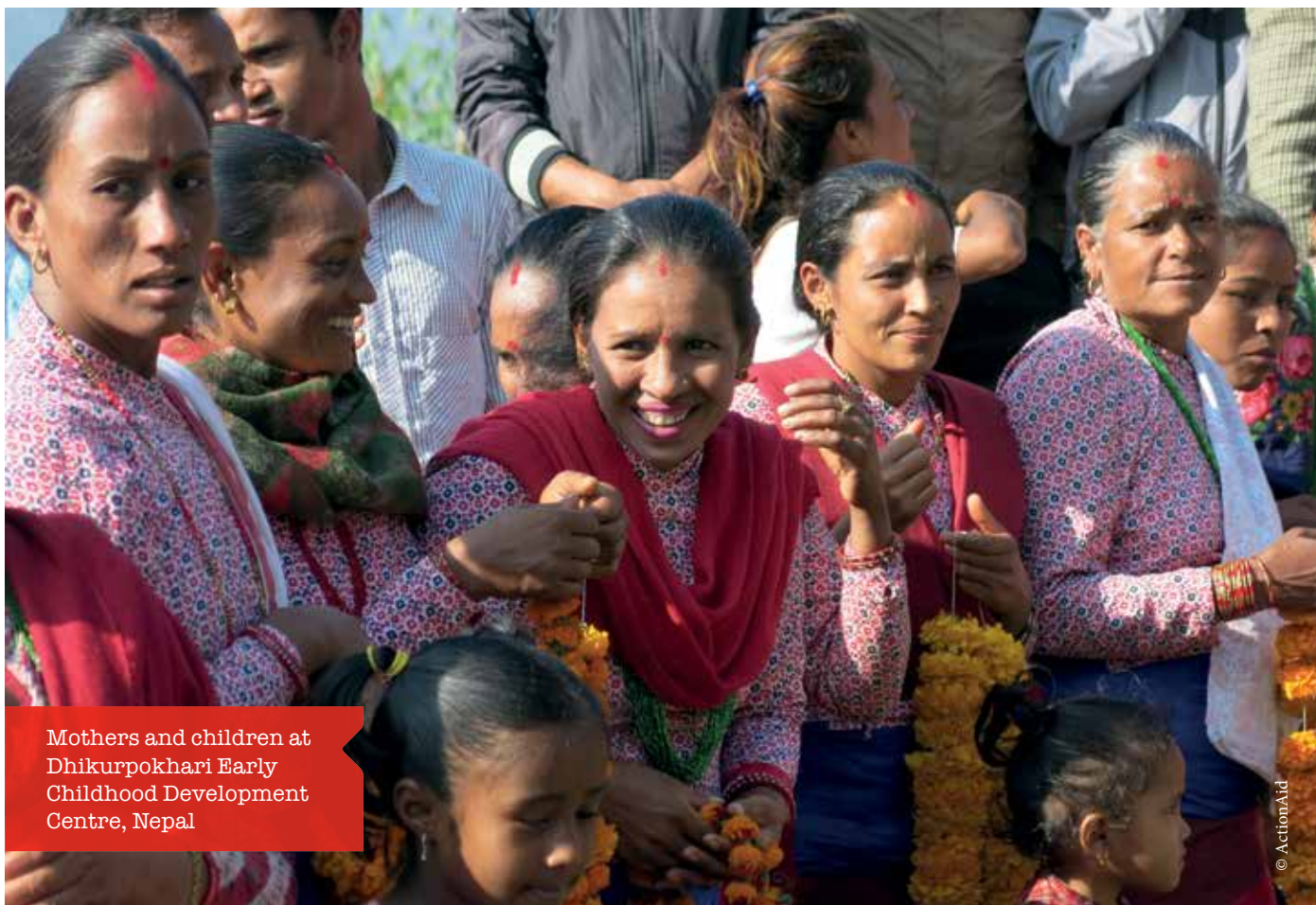
Mothers and children at Dhikurpokhari Early Childhood Development Centre, Nepal